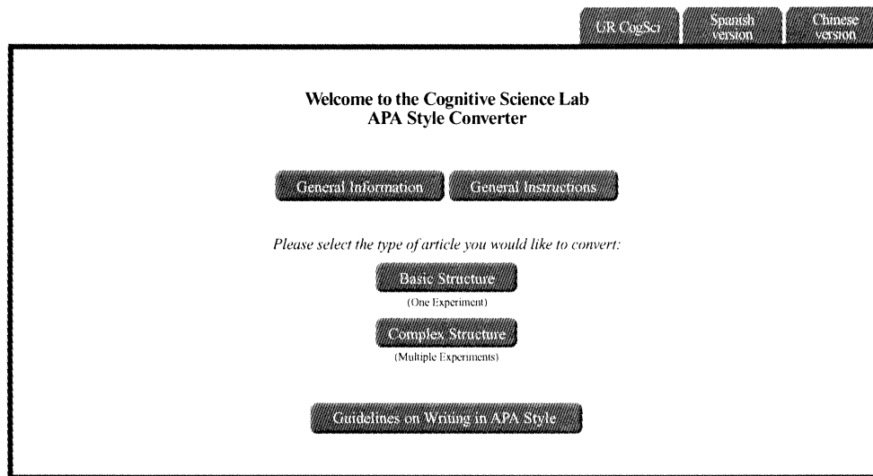
Figure 1. The main page of the APA Style Converter.

to other language versions, they simply click on the links at the upper right hand corner of the page. The Chinese version and the Spanish version provide exactly the same interface as the English version, and the only difference between these versions is in the language of instruction.